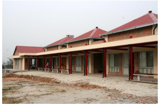
School voor speciaal onderwijs 1ste fase