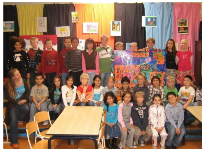
Een van de groepen met hun kunstwerk