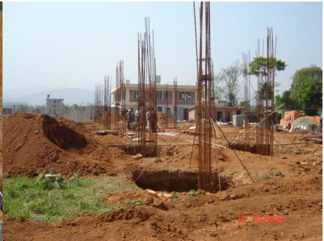
Het leggen van de fundering