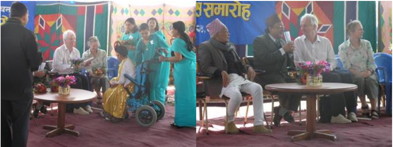
Ceremonie van het leggen van de fundering