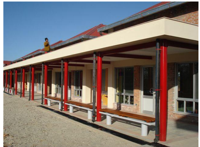
De Ireland Bhawan (gebouw) schittert in de zon!