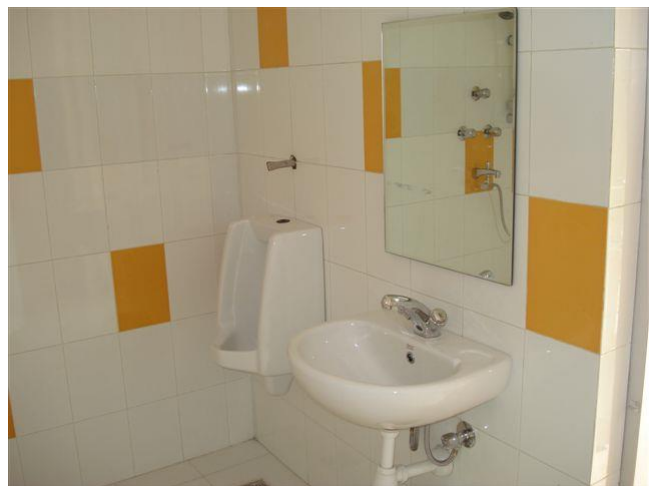
Het sanitair wordt gesponsord door stichting Maha Mata.