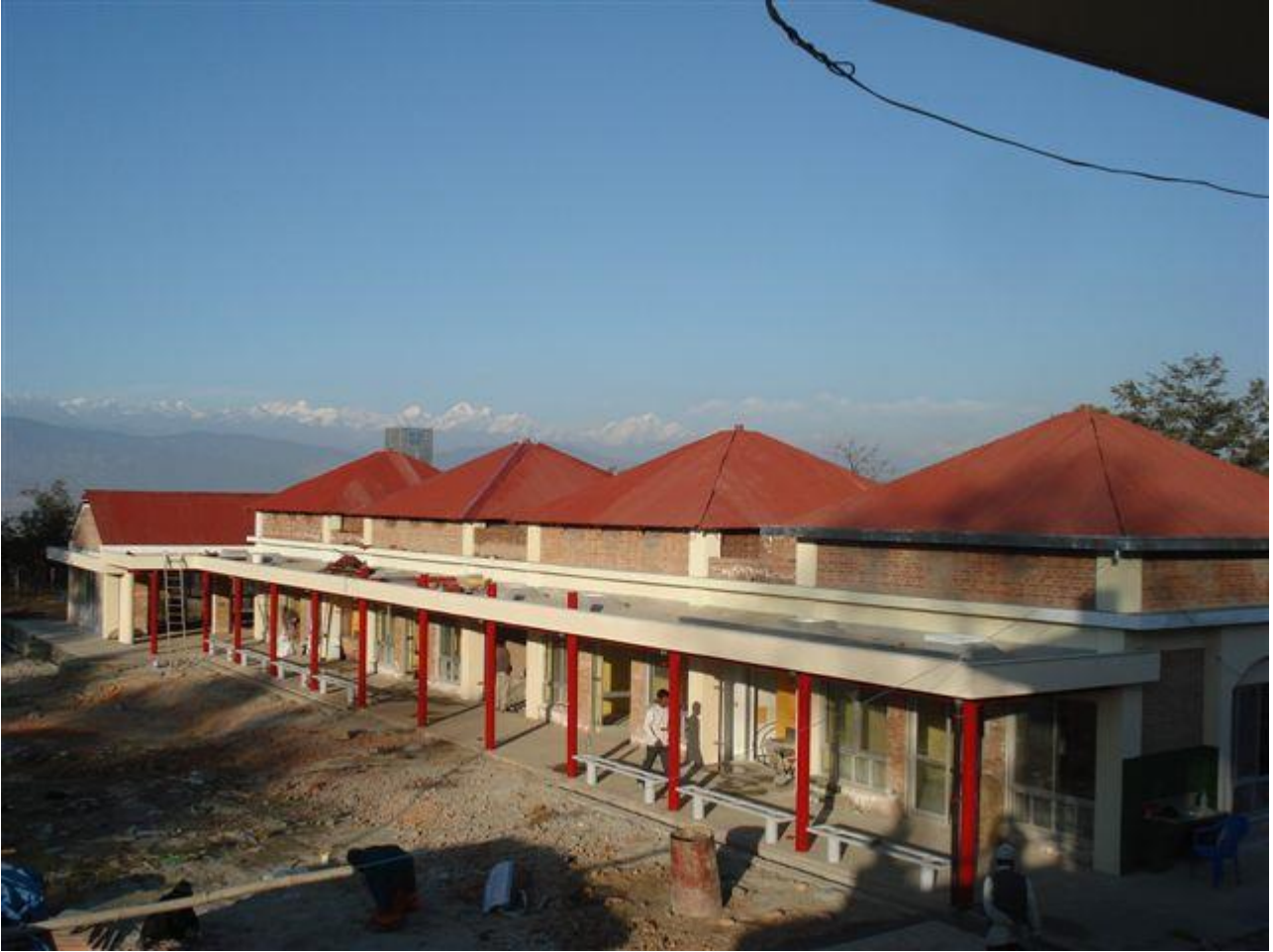
Voltooiing 1e fase