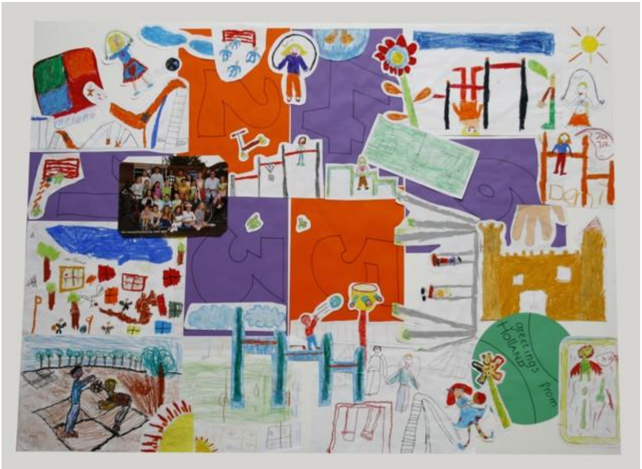
Kinderen van de Van Leeuwenhoekschool uit Hilversum maken kunstwerken voor de school in Kathmandu