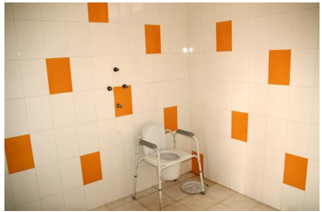
Douche en wc stoel