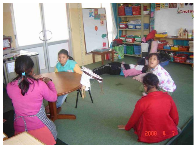
De kinderen maken dankbaar gebruik van de school