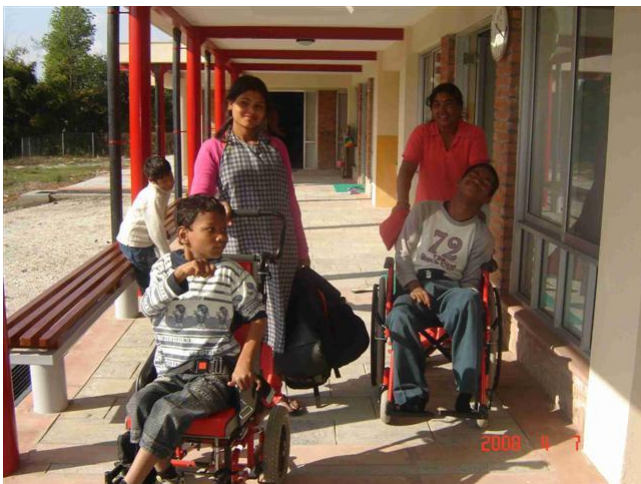
De kinderen vinden de nieuwe school prachtig